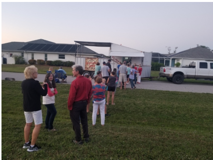
Food worth waiting for!