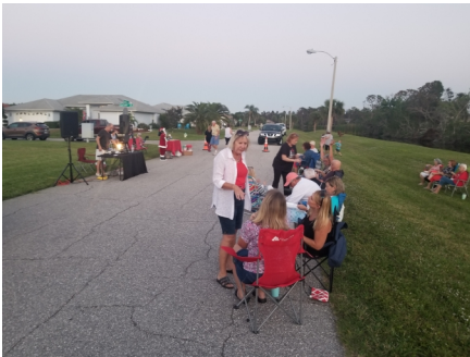
Food Truck Night

They have a bad habit of snapping when approached. (Zoomed close-up pictures are safe.)