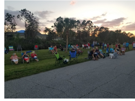
Food and Music